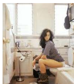
(left, comedienne Sarah Silverman on the pot. Degrading people by defining people as bodies without souls.)

I am not speaking from a Christian or Biblical perspective. I am from a secular background. The difference is that I recognize, in secular terms, that God is the magnificent moral and natural order governing the universe. God is Ultimate Reality. Fulfillment lies in discerning the Divine Will not flouting it. The Illuminist denial of God is a rebellion that cannot be won but they'll create mayhem trying.